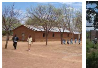
Roof of St. Andrew's Church