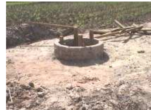
Restored Traditional Well