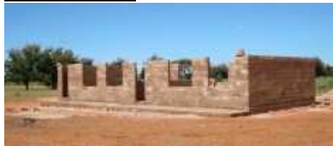
Building new Primary School