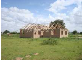
Beginning Roof Project