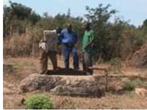
Old well bore to cleanup