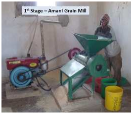
1 st Stage Grain Mill