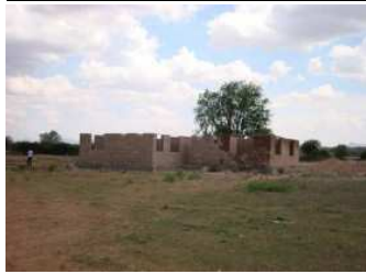
Beginning Children's Home