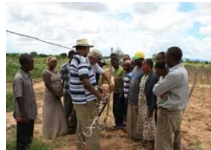
Grape Pruning Seminar