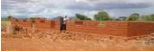
Assisting with Building new Primary School