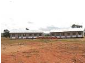
Classrooms - Prince of Peace Primary School