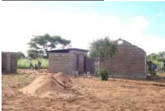
Well Keeper's House