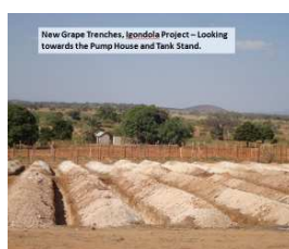
New Grape Trenches