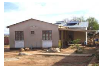
Kitchen & Porch Addition