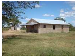
Grain Mill Building