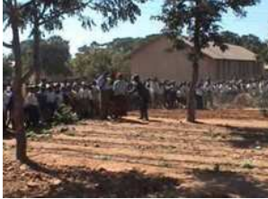
Garden at school