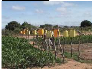
Primary School Garden