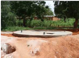
In-ground Water Tank