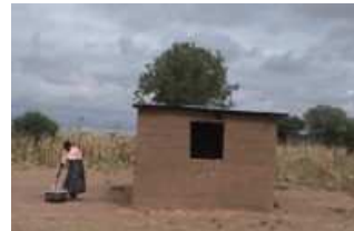
Teacher Office and Store