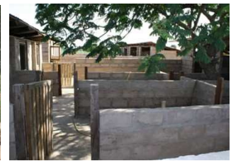
4 th Pig Sty In-ground