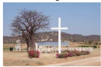
Entry to Amani Center