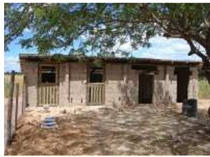
First "Pig Sty"