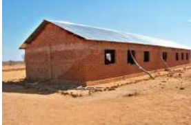
Primary School Roof