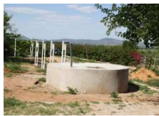
In-ground Water Tank