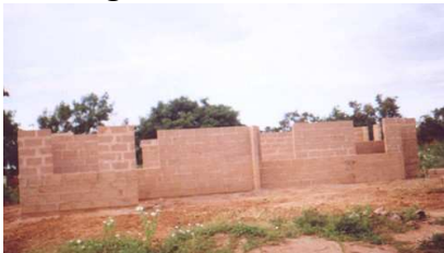
New Roman Catholic Church