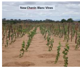
New Chenin Blanc Vines