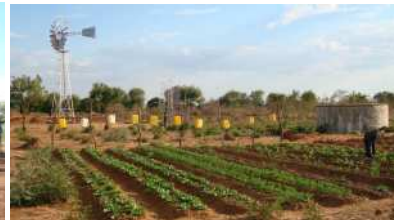
Windmill and Garden Area