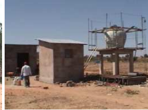
Well House & Water Tower