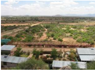
Main House Area