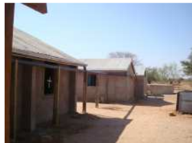
Gutters to collect water