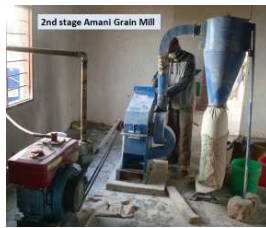
2 nd Stage Grain Mill