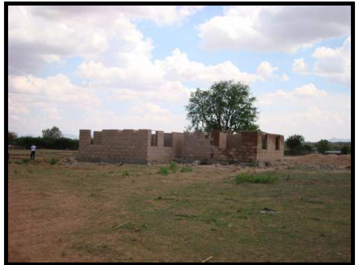
Partly completed 'home' = Children's Home Mahoma Makulu