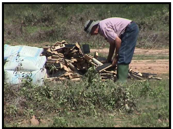
The gift of work