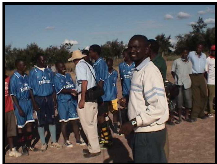
Greeting the teams – football