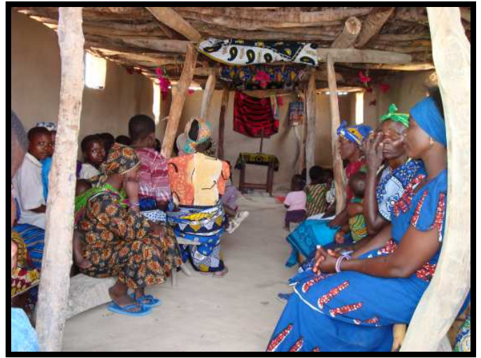
Worship in a typical small GoGo style village church