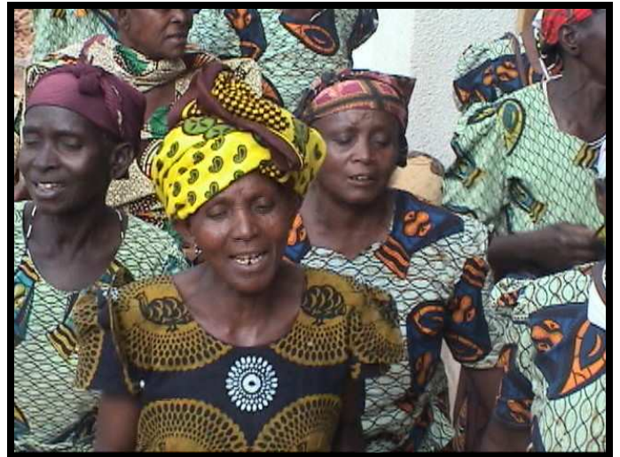
Colorful women – Visiting choir at the center