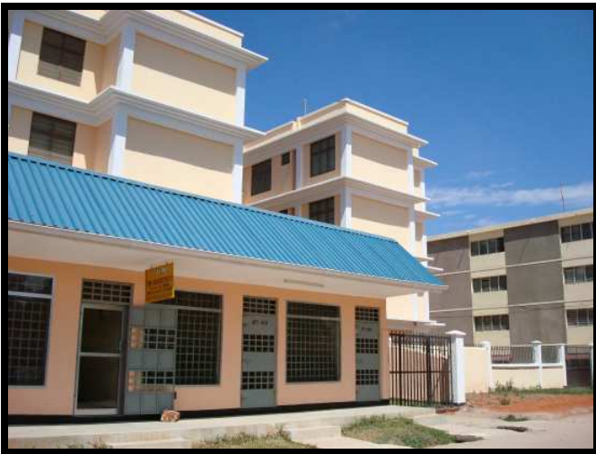
Our new office in Ddoma – door far right