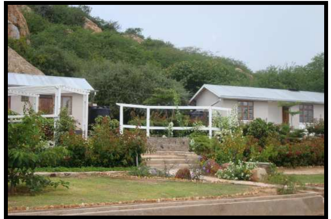
View at the housing – front