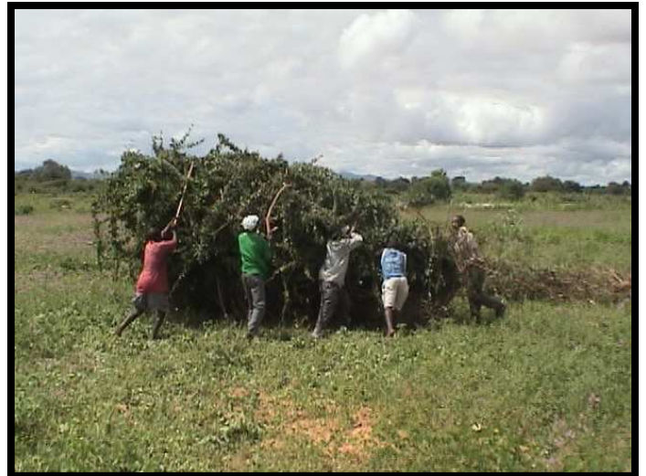
The early days at the Center – clearing the thorn bush