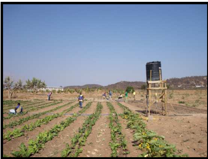
Drip Irrigation from the traditional well