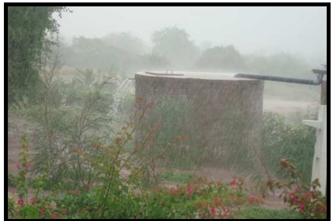
A rainstorm and an overflowing tank