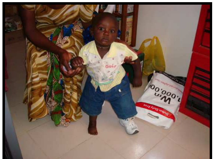
I can stand up now!