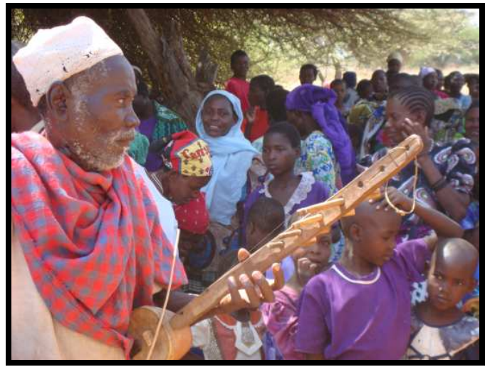
The Music Man at a village Church