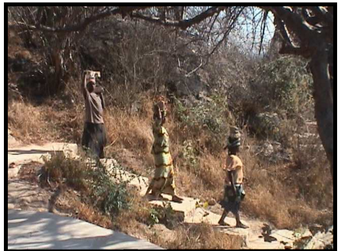
Carrying rocks for the landscaping