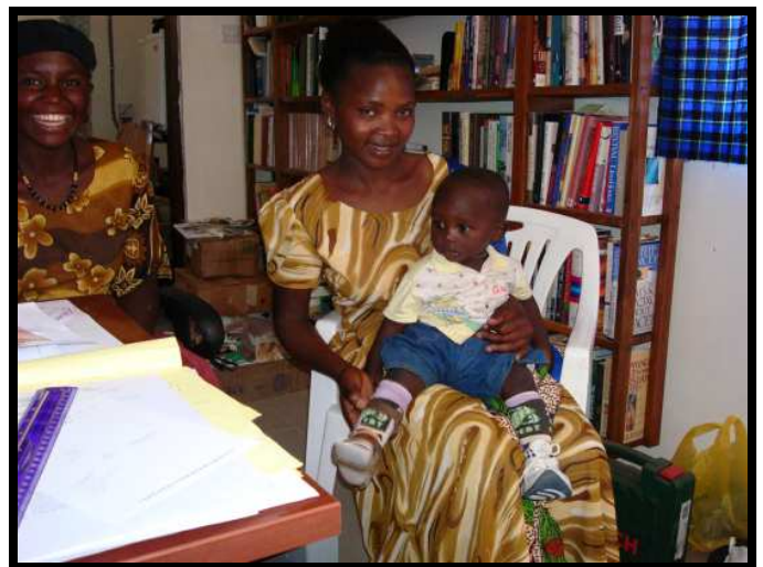
A boy who had a 'floppy foot'. Amani covered his surgery and follow-up treatment