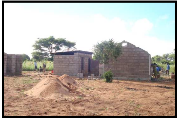
The 'new' well keeper's house under construction/renovation at Mvumi makulu