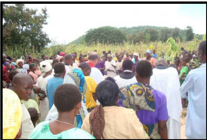
Dedicating a new village church site