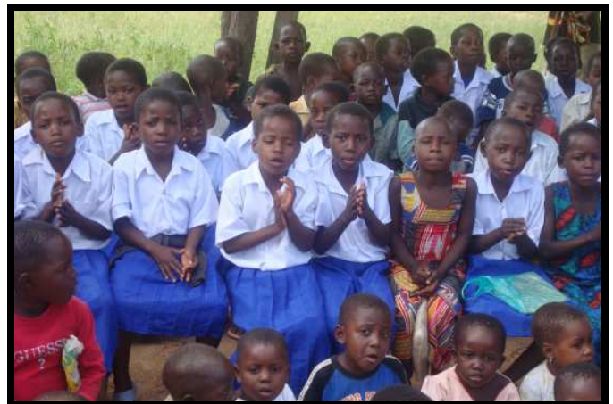
Singing to the Lord