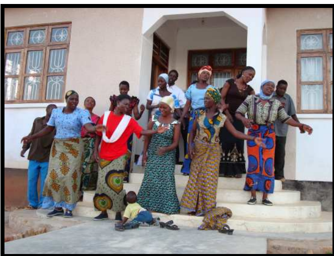
A church choir singing on the front steps at the Center