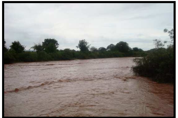
The river after a downpour