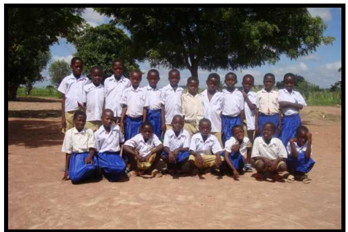
Igondola Children's Project – Grade two in new uniforms