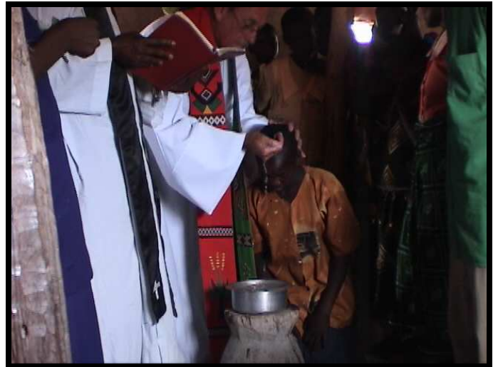
I baptize you....