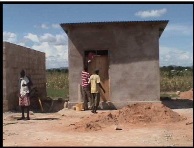
The tool room