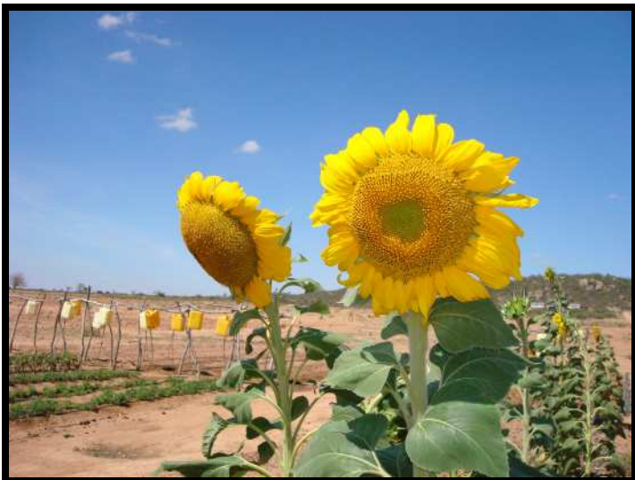
Sunflowers – God's gift