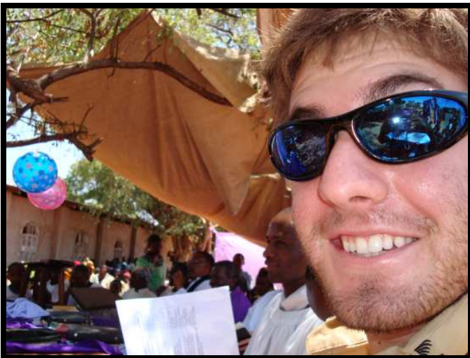
An American in Paris – NO! Tanzania!