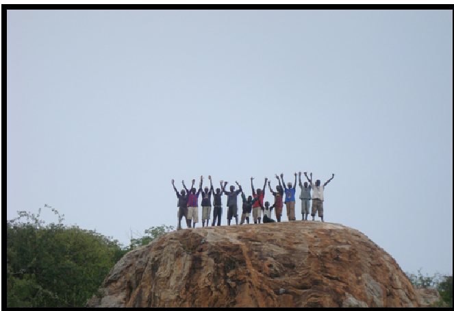
On the Rock – at the rear of the housing - A grand view over the Center and the Great Valley