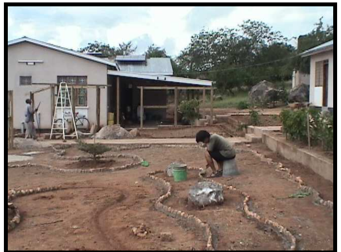
Nathanial Asbell and the beginning of the landscaping