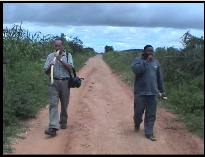
A snack along the way – walking home following a flat tire and no spare