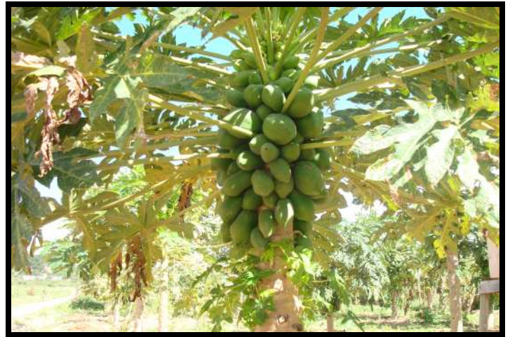
A 'bounty' of paipai