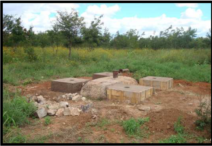
The windmill at Mvumi Makulu – a string foundation