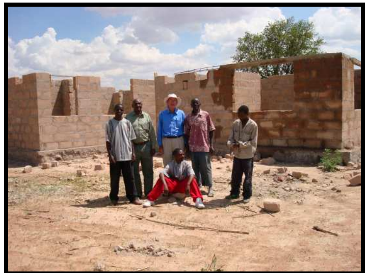
Some of the Mahoma Committee