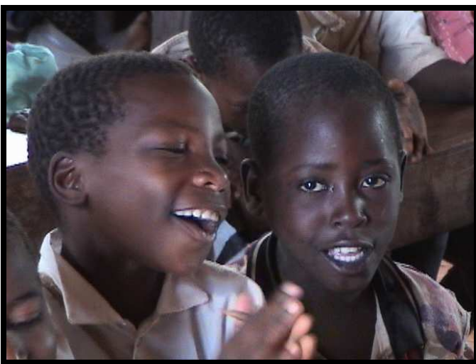
Two happy lads at school