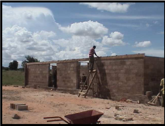
Building the large shed at the Center