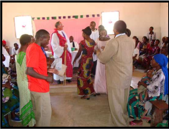
At a village church – dressed in royal GoGo style.