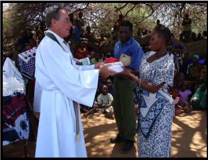
Books for Sunday School teachers – Lodge Village