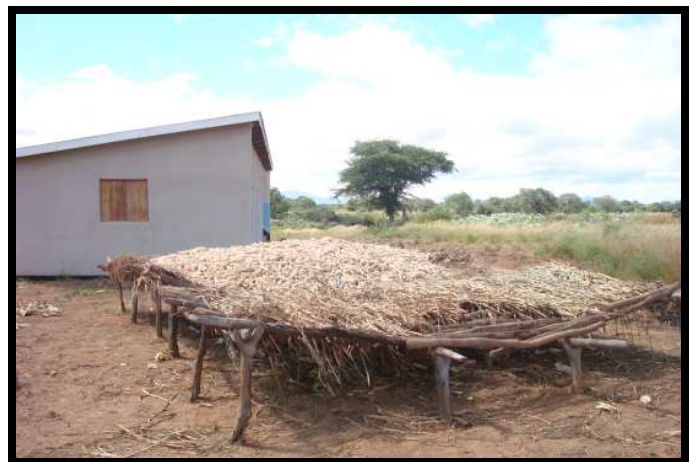
Maize on the drying rack