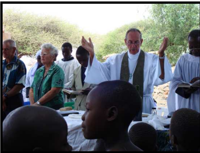
Celebrating Holy Communion at Lodge