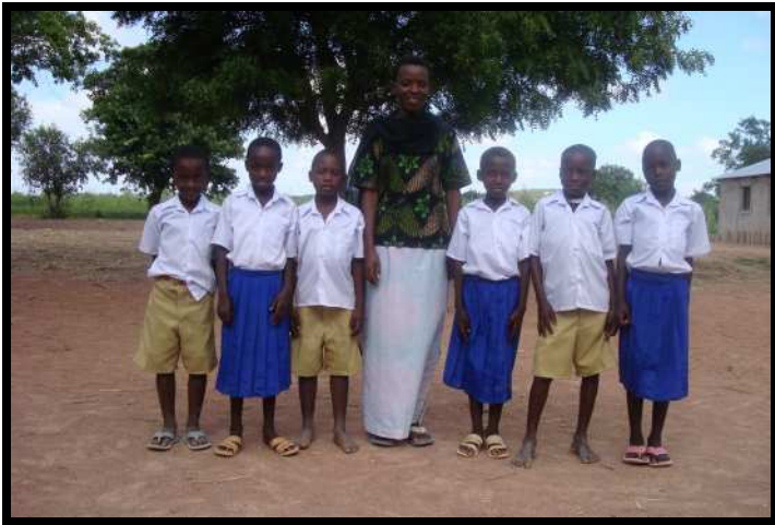
A teacher and children