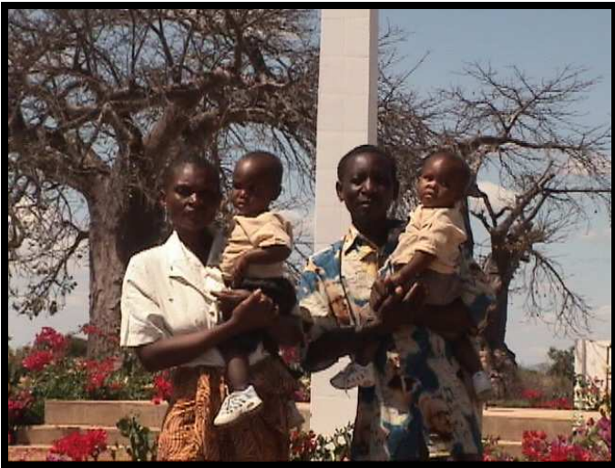
At the Cross. This young mother is partly sponsored at Msalato Bible College