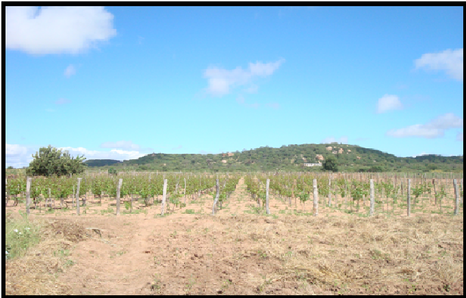
View of part of the Vineyard