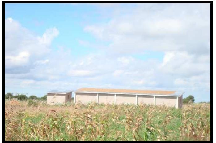
Peanuts drying on the roof