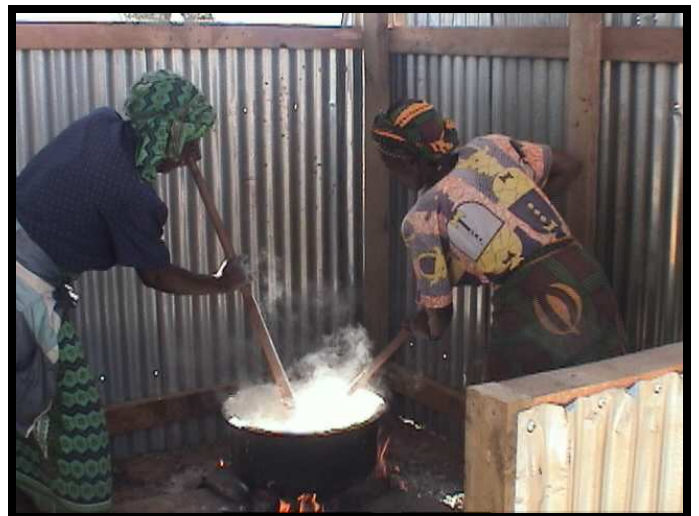
Cooking Ugali for the workers