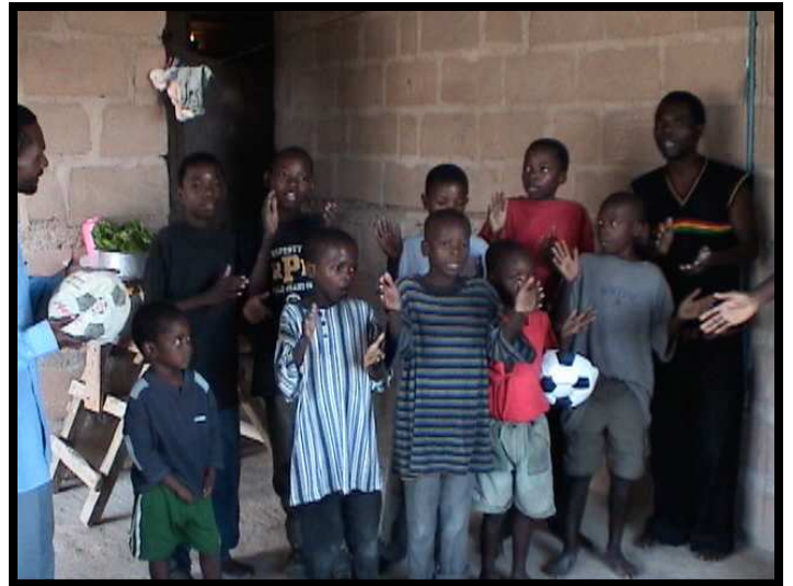
Some of the 'street children' cared for