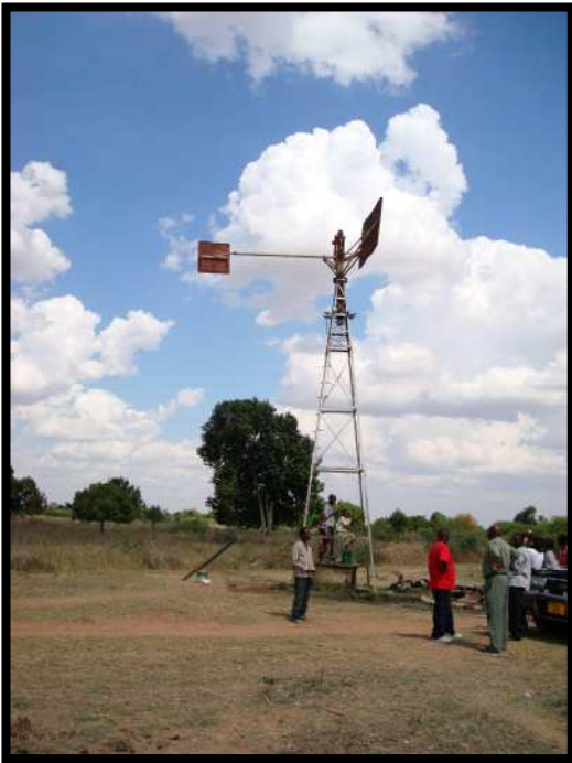
Needing a new windmill. The old well the village has gifted to the Mahoma Children's Home