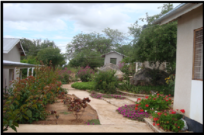
View at the Housing – along the rear walk