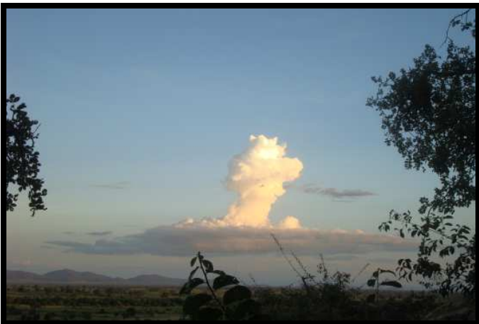
A splendid cloud formation