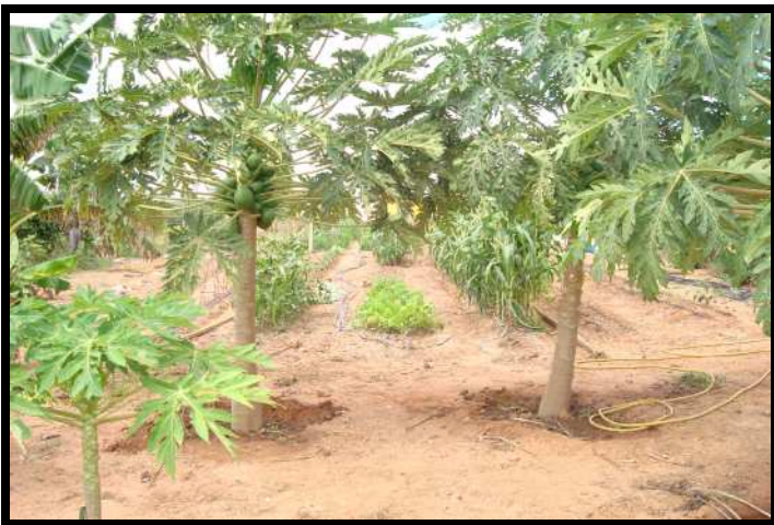
In my garden!